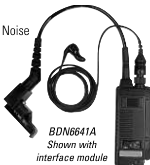
BDN6641A Shown with interface module

BDN6641A Ear Microphone for High Noise Levels (up to 105 dB), Grey