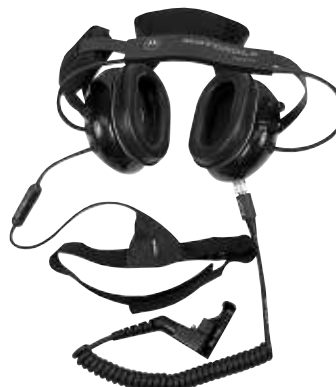
BDN6636B (Shown with adapter cable BDN6638A)

BDN6636B Voice-Activated Headset with Throat Microphone, Requires Adapter Cable, Includes 110V Charger