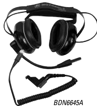
BDN6645A (Shown with adapter cable BDN6638A)

BDN6635B Voice-Activated Headset with Boom Microphone, Requires Adapter Cable, Includes 110V Charger