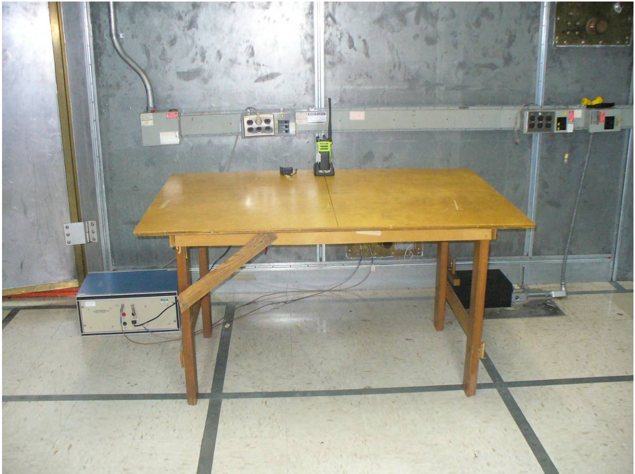
Figure 3: Power Line Conducted Emissions – Front View