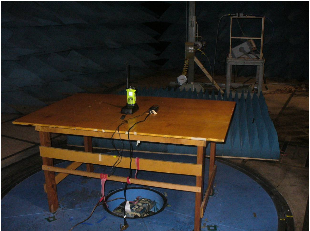
Figure 2: Radiated Emissions – Back View