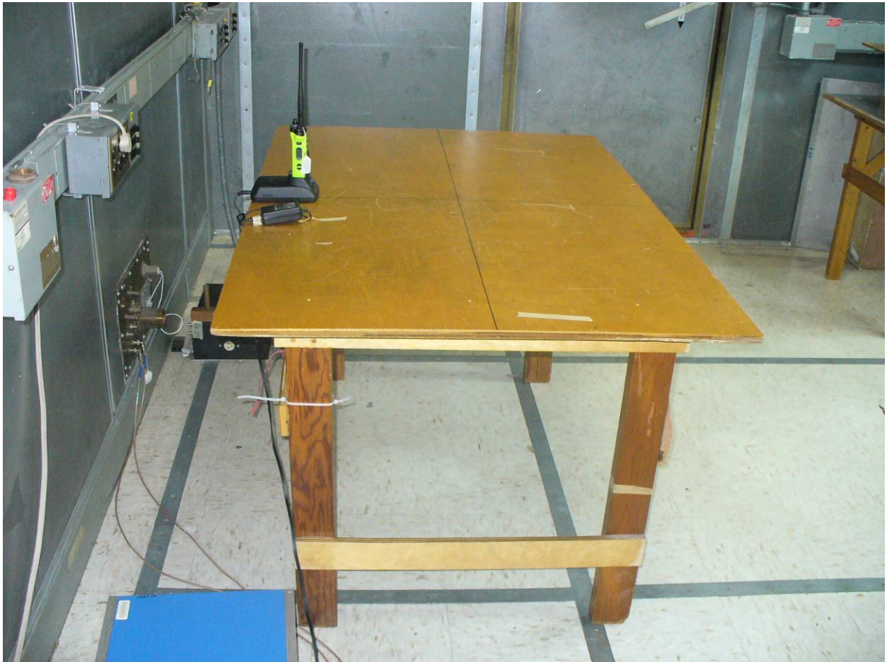
Figure 4: Power Line Conducted Emissions – Side View