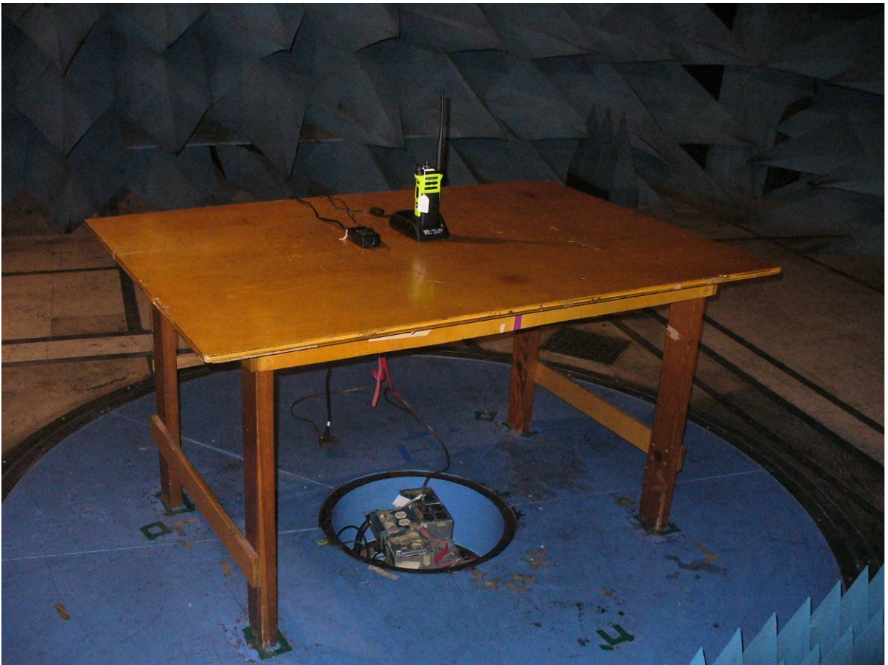
Figure 1: Radiated Emissions – Front View