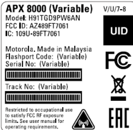
Model 2.5 (Limited Keypad)