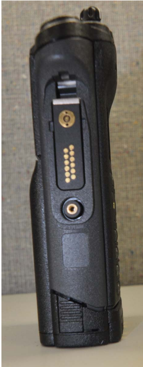
Exhibit 3 F SIDE VIEW (RIGHT)