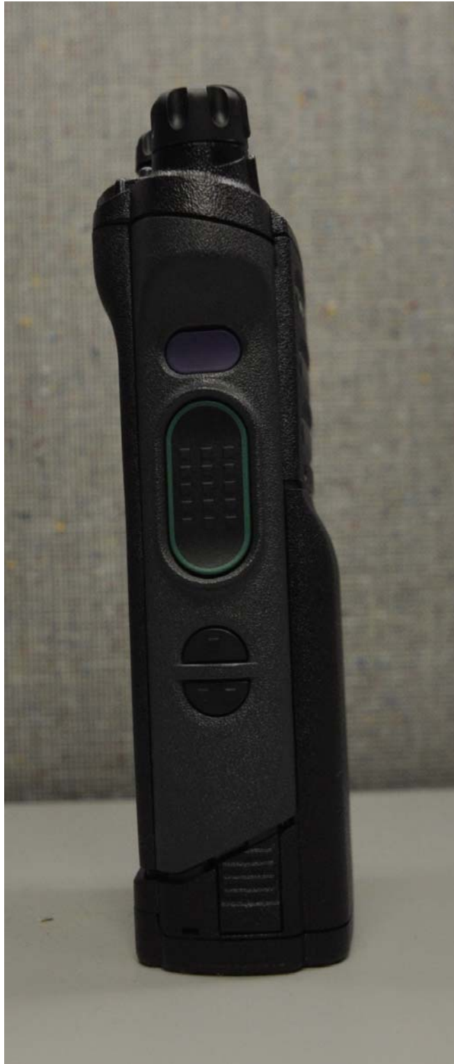
Exhibit 3 G SIDE VIEW (LEFT)