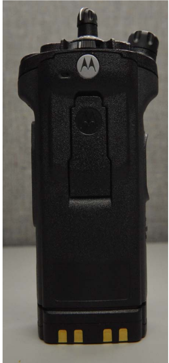
Exhibit 3 C BACK VIEW WITH BATTERY - MODEL 1.5