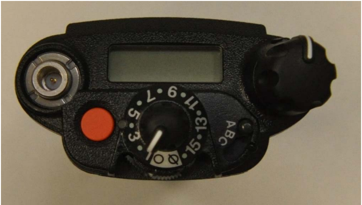
Exhibit 3 H TOP VIEW