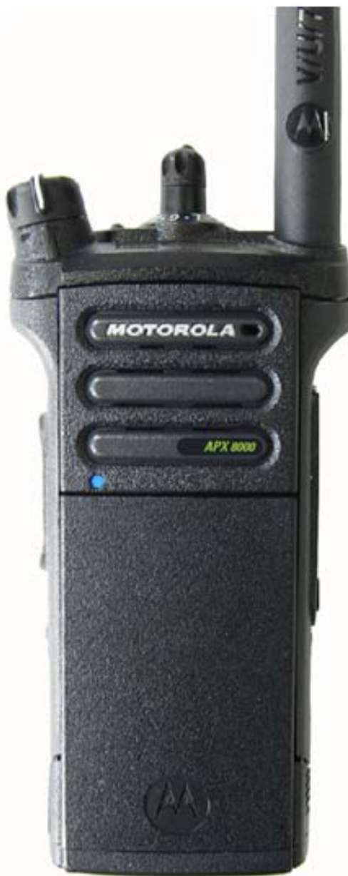
"APX 8000 (variable)" label

Note: May be sold with the letters "APX" embossed on the speaker grill, or with a label stating "APX 8000 (variable)", where "variable" could be blank or signify an option (i.e. SW Feature or Factory Verification Level). Both are non-metallic and will not effect electrical / radiated performance.