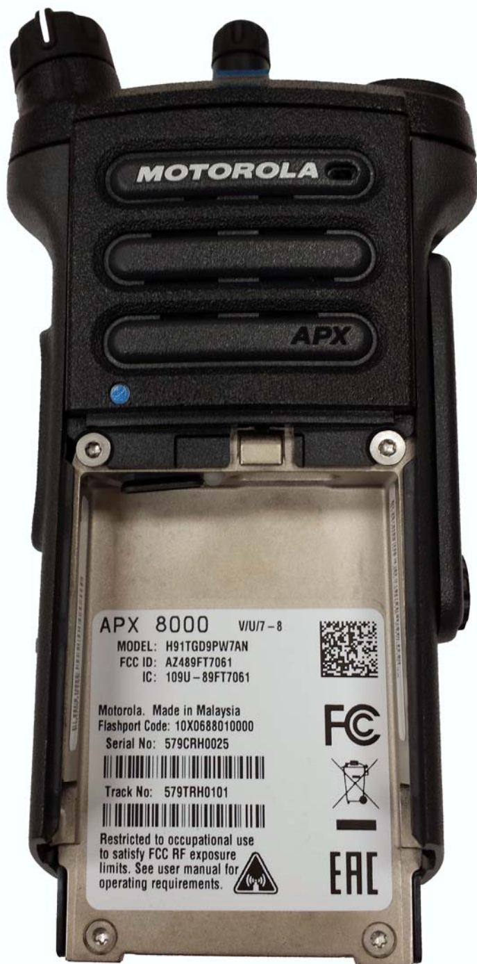
Exhibit 3 E FRONT VIEW (FCC LABELS)