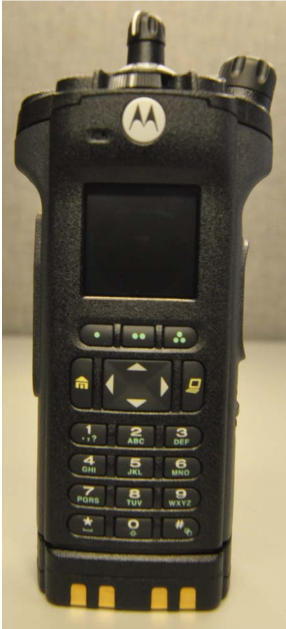
Exhibit 3 B BACK VIEW WITH BATTERY - MODEL 3.5