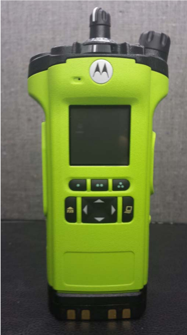
Exhibit 3 D BACK VIEW WITH BATTERY - MODEL 2.5